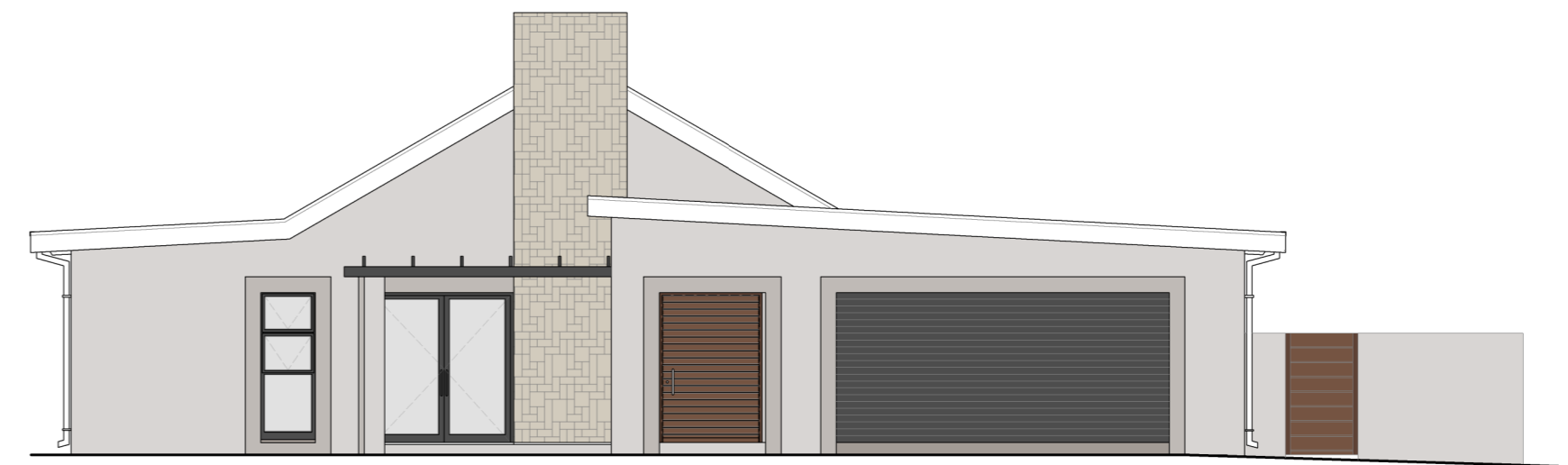
1: 100 FRONT ELEVATION