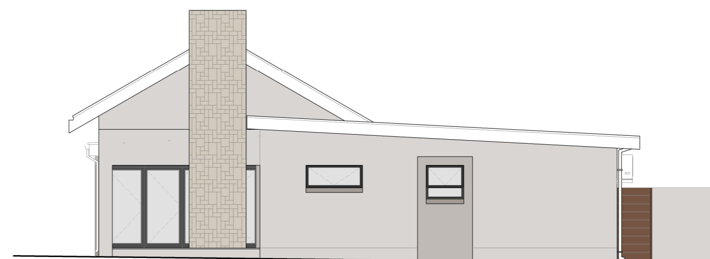
1: 100 BACK ELEVATION