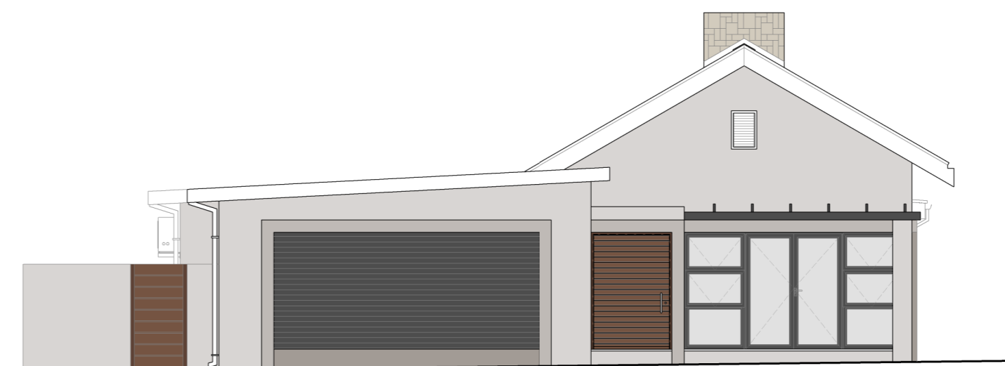
1: 100 FRONT ELEVATION