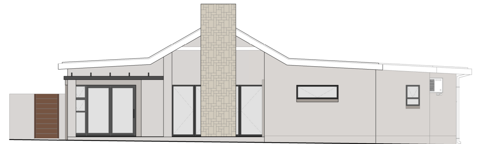
1: 100 BACK ELEVATION