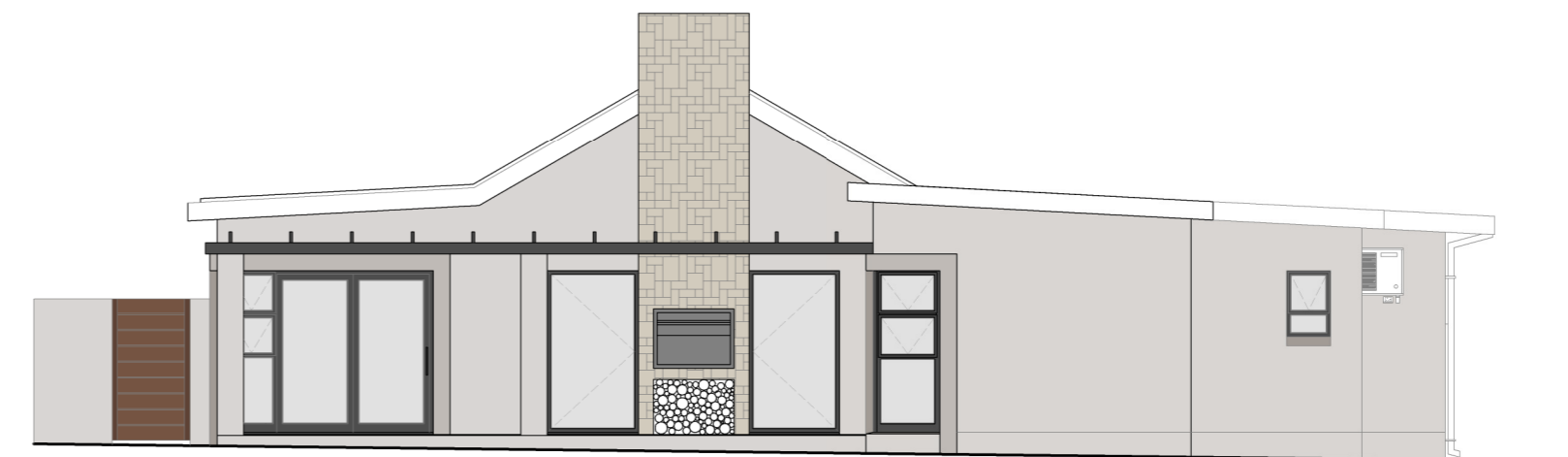
1: 100 BACK ELEVATION