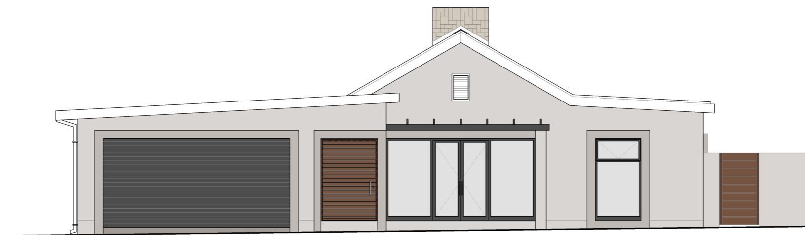
1: 100 FRONT ELEVATION