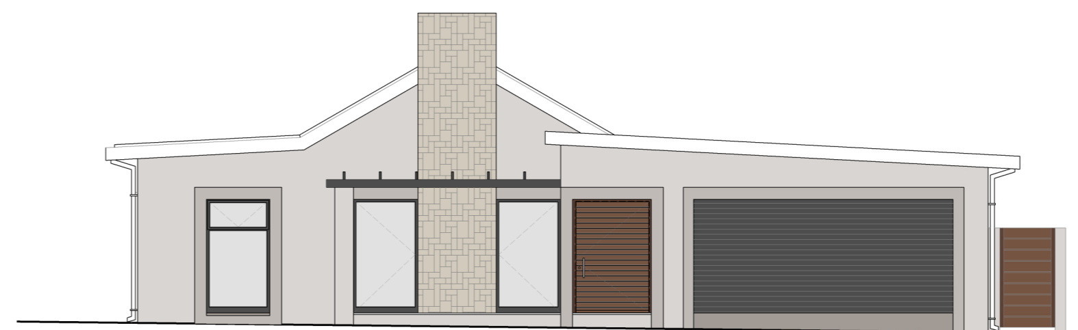
1: 100 FRONT ELEVATION