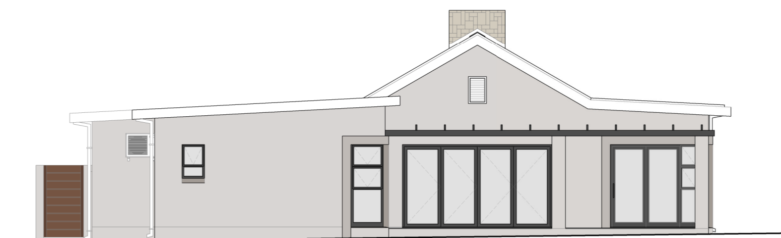
1: 100 BACK ELEVATION