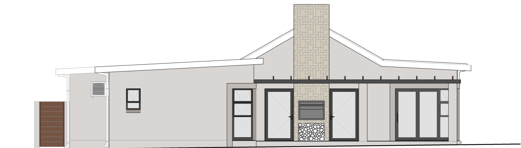
1: 100 BACK ELEVATION